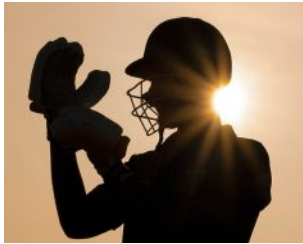
CSR News: Cricket Tournament for Visually Impaired Players Organised at MCA Ground, BKC, Mumbai