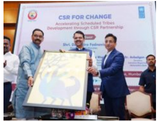
Maharashtra Committed to Development of Tribal Areas with CSR Funds: Chief Minister Devendra Fadnavis