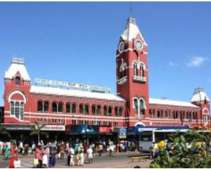
Top CSR Projects in Chennai